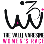
TRE VALLI VARESINE Women's cycling race