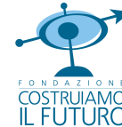
Supports projects and life of sportive associations