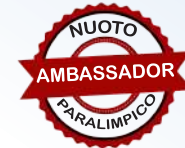
MARTINA RABBOLINI Swimming Paralympic Champion