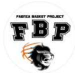
E-WORK FAENZA SERIE A1 Women's Basket